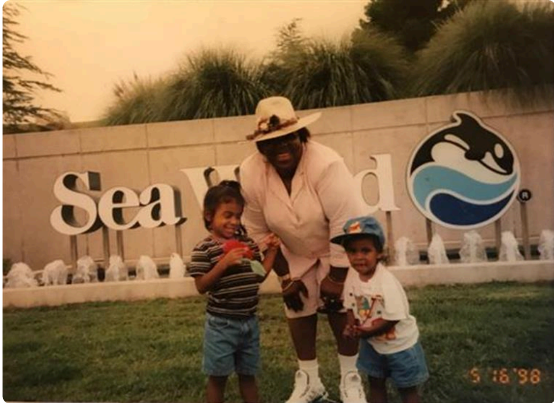
Our Sea World San Antonio trip!!